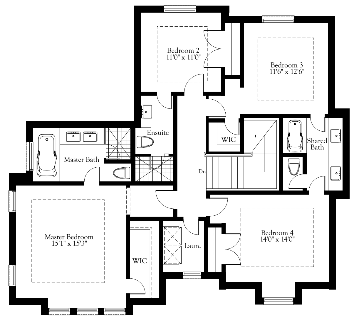
| Second Floor |