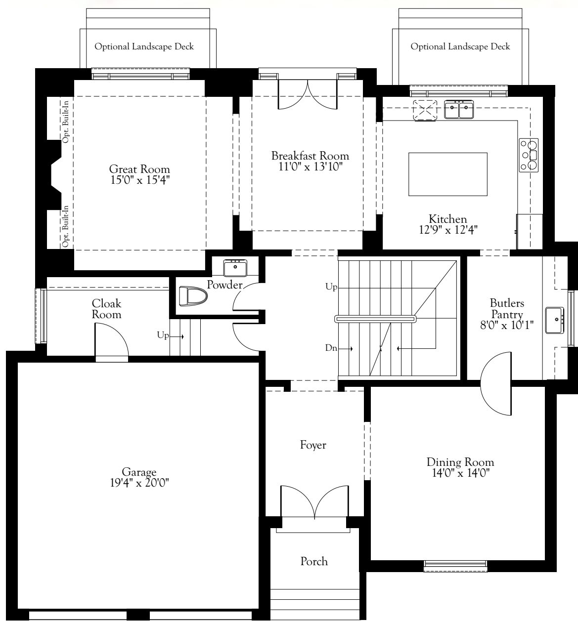
| Main Floor |