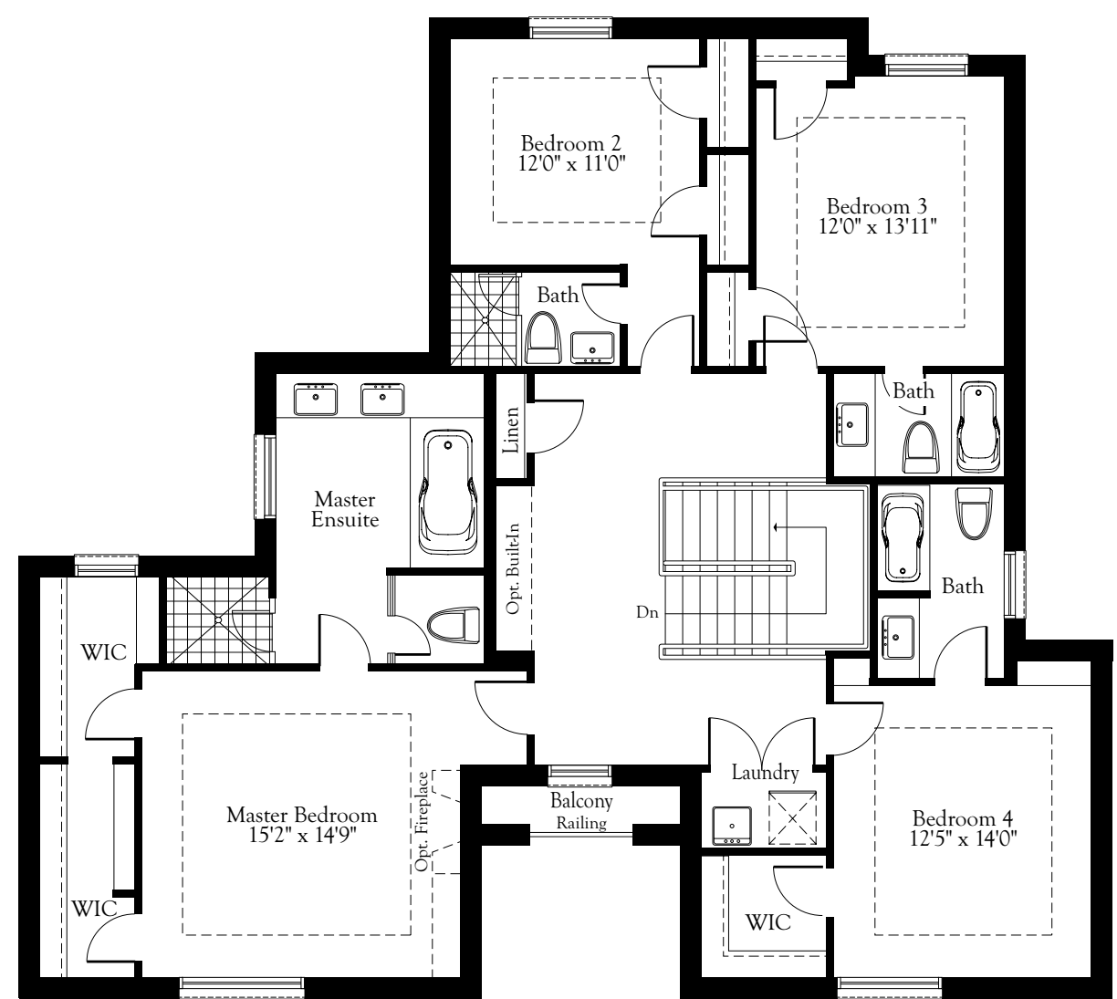
| Second Floor |